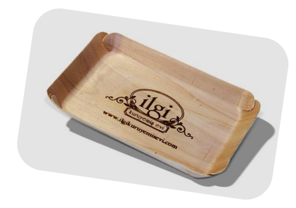
Unique labeling decoration options such as burning, typography, wood tinting, and hot stamping.

The poplar raw material is produced from sustainably managed forests. By using wooden food packaging, your final product not only has an upscale appearance with a natural look and feel, but also sends an eco-friendly message. Our wooden packaging can also be lined with parchment paper or plastic for your specific needs.